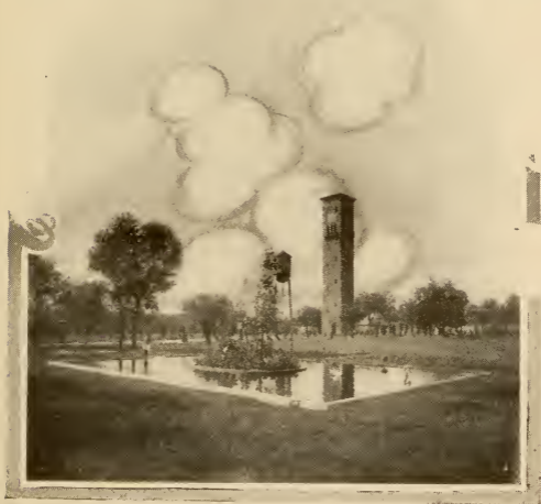
The Quadrangle—Fort Sam Houston

The San Antonio river winds through the heart of the city and is spanned by dozens of bridges and along most of its course is lined with big trees bringing bits of sylvan beauty into the heart of the city. In addition parks and plazas are scattered throughout the city. Of these the most beautiful is Alamo Plaza on which faces the famous chapel; Travis Square where the Confederate monument towers its graceful height; Main Plaza on which the San